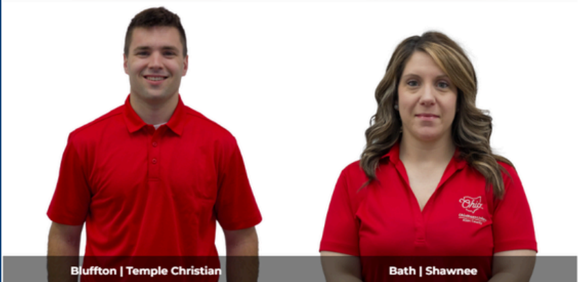
Bluffton | Temple Christian